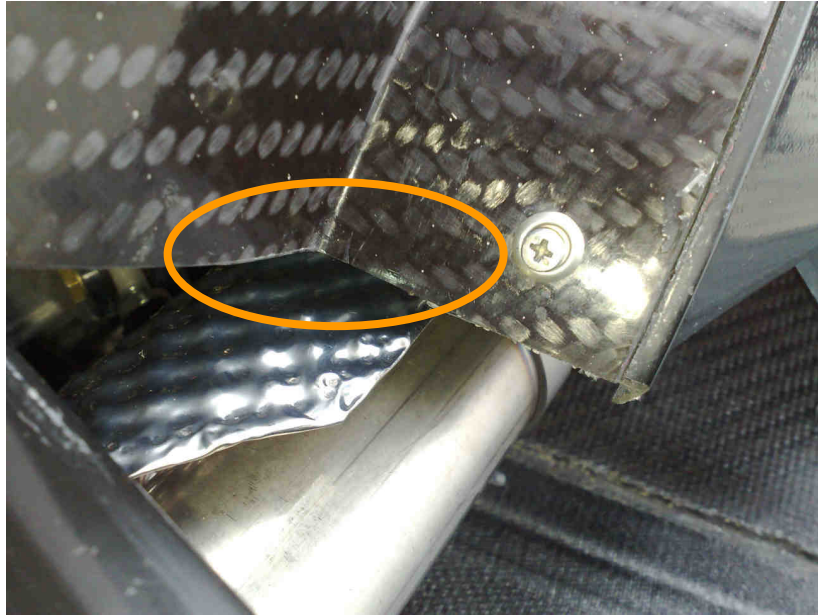
On some cars, it could be needed to slightly bend the thermal shield to avoid any contact with the engine cover.

The thermal shield is delivered with its supports.