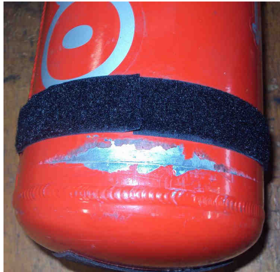
Due to vibration, the extinguisher wears on its rear support

Following several issues with the extinguisher, please check if your extinguisher is not worn out as shown on the picture below: