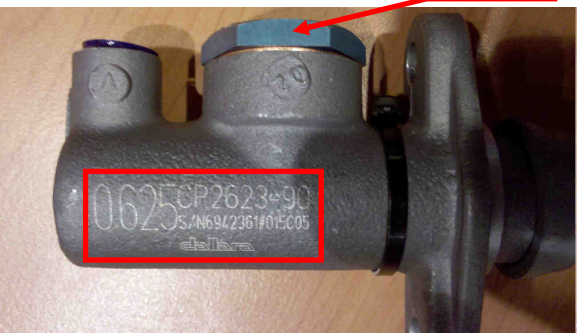
FR3.5 5/8" master cylinder

- The reference engraved on the body is different: