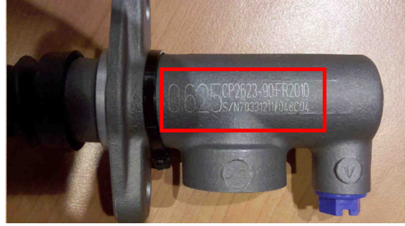
FR2.0 5/8" master cylinder

The blue reservoir adapter (1) must be removed to fit the FR2.0 reservoir