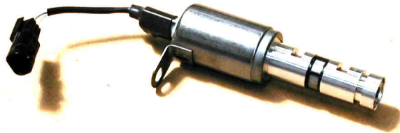
New one with fly wires

It is now available under the reference 77 11 166 735.