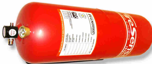
New S.P.A. extinguisher

Note: The old type of extinguisher is not available anymore.